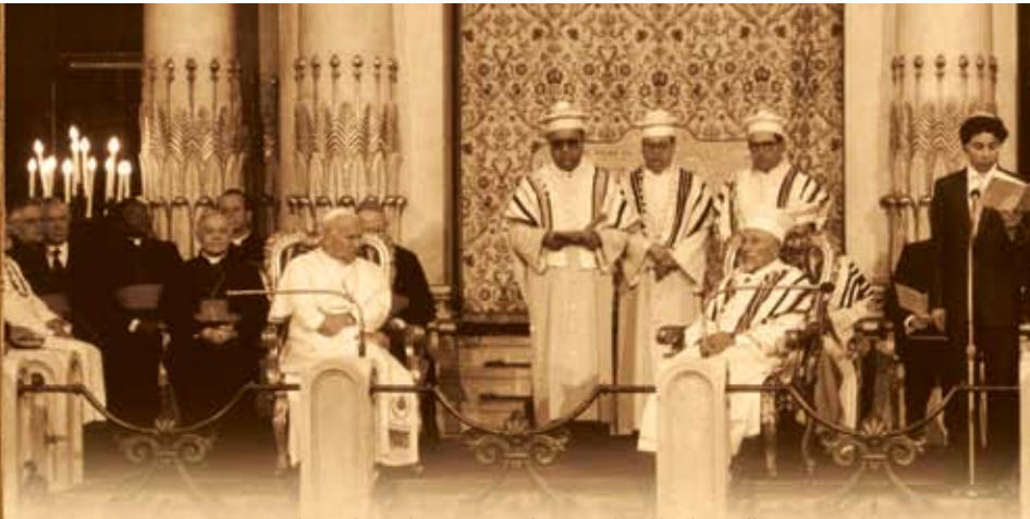
Pope John Paul II in the Synagogue of Rome with Rabbi Elio Toaff – 1986

CHRISTIANS: BROTHERS AND SISTERS, MANY OF US HAVE BEHAVED SHAMEFULLY. WE HAVE NOT REPLACED THE JEWISH PEOPLE WITH OUR NEW COVENANT. OUR "ELDER BROTHERS AND SISTERS" CONTINUE TO OWN A SPECIAL BOND, A COVENANT WITH THE LORD. THE JEWS HAVE RETURNED TO ISRAEL, THEIR ANCESTRAL HOME. WE HAVE SINNED BY PERSECUTING THEM THROUGHOUT THE CENTURIES." THESE PROFOUND WORDS CONSTITUTE ONE OF THE PRINCIPAL LEGACIES OF THIS GREAT SOUL WHO WAS KAROL WOJTYLA, BELOVED POPE JOHN PAUL II.